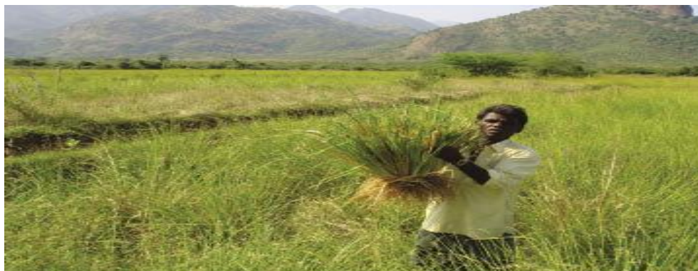
Figure 4. Shows trimmed clumps of vetiver grass

is quite possible to produce at least 500,000 slips (with three tiller each) per ha per year. Figure 4.