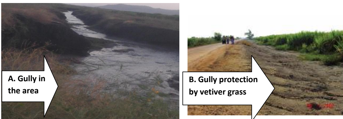
Figure 2. Shows gully formed due to swelling character of soil at kuraz sugar development project (A), gully Protected by Vetiver grass (B)

crop. It also shows silt that would have been eroded out of the area, has been retained behind the hedge filling a low spot, thus leveling the field for greater ease of cultivation.