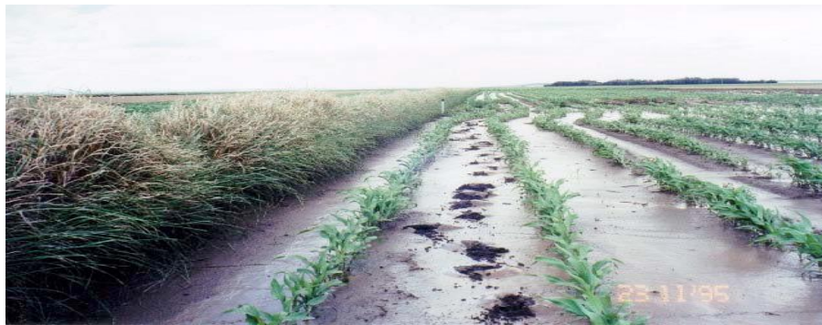
Figure 1. Shows maize protected from lodging (Sources: Greenfield, J.C. 1990)